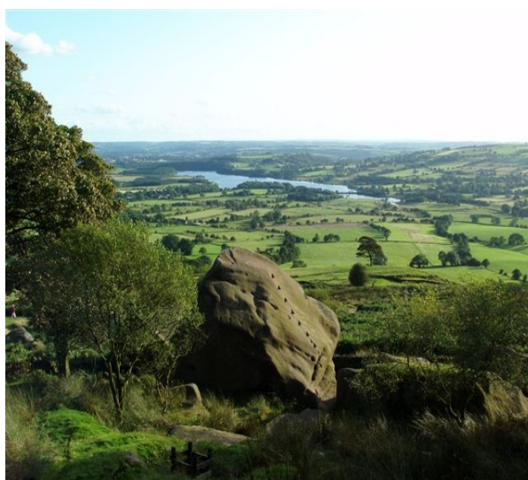
View from the door/trestle table