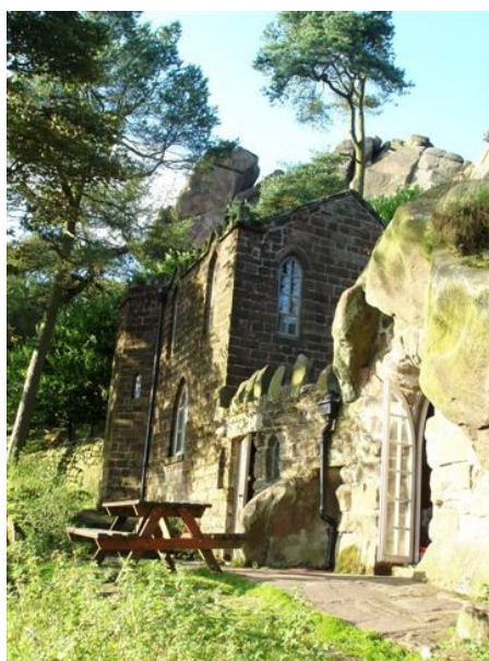
The BMC's Don Whillans memorial hut at the Roaches in Staffordshire

It's a fantastic hut and a fantastic crag. It is surrounded by climbing history – with plenty of original photos of Don Whillans on Sloth and Valkyrie, and Joe Brown with other early pioneers.